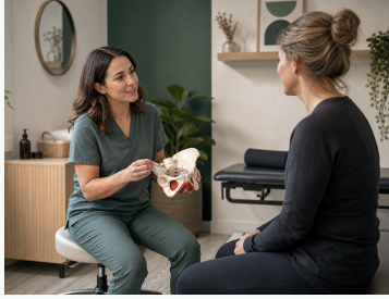
Benefit: private support without embarrassment