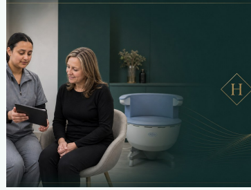
Benefit: a clear plan for symptoms that affect everyday life.

Pelvic health care is about getting your confidence back: laughing without leaking, exercising without fear, walking without heaviness, having sex without dread, and not planning your day around toilets. These symptoms are common, but they are not something you just have to put up with.