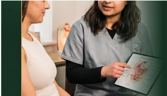
Benefit: understand the problem before treating it.