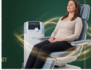
Benefit: treatment options beyond just being told